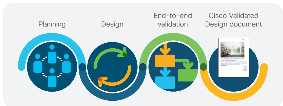
Figure 2 Design process for Cisco UCS integrated infrastructure.

In addition to design excellence, we provide, through our Technical Services organization, the option of single-number support for many of the systems based on Cisco UCS Integrated Infrastructure, giving customers a single accountable support structure for all design components.