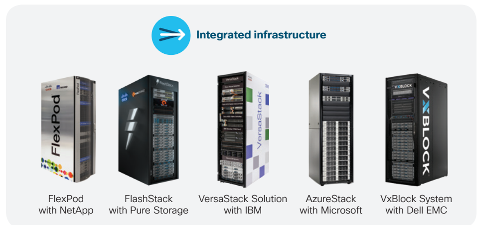
Figure 1 Our portfolio of integrated infrastructure solutions

Cisco and EMC led the way in creating the Virtual Computing Environment (VCE) coalition, initially as a joint technology program and then as a division of EMC Corporation. VCE became the world leader in integrated infrastructure that is designed, purchased, packaged, delivered, and supported as prefixed building blocks called VCE vBlock. When EMC was acquired by Dell, VCE solutions were rebranded as VxBlock with Dell EMC.