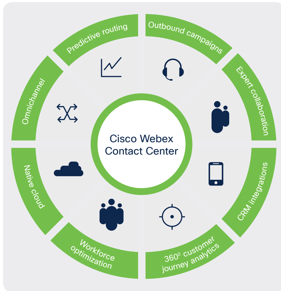
Figure 1. An innovative set of capabilities for the cloud-based contact center of today and tomorrow

• Outbound campaigns. An outbound campaign manager automates outbound calls for sales and marketing campaigns. Preview and progressive dialing help assure agent productivity. Easy administration, a compliance tool, flexible and intelligent list management, and sophisticated dial management rules—including campaign chaining—put you in control.